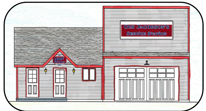
Rendering of Service Bay Addition next to Gus' Station.