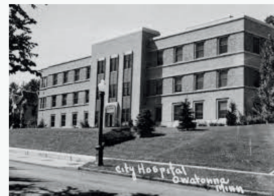
Owatonna City Hospital

By 1958, they began a $1.3 million addition that was completed in 1961. This bassinet was removed from the building because they were being replaced during the renovation process. This bassinet was rescued by a former medical records librarian, who donated it to the WCHS. Due to its significance to the history of Steele County, WCHS reached out and the bassinet was transferred into our collection.